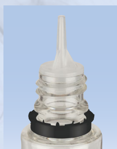
Tamper evidence ring stays on neck