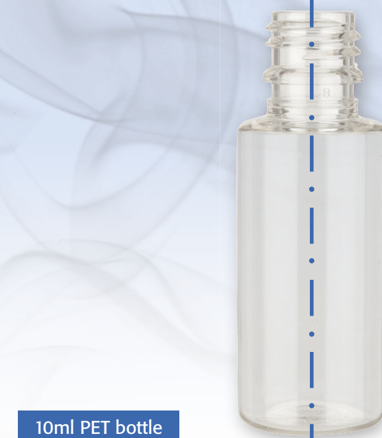
10ml PET bottle