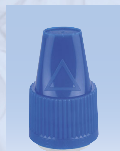
Closure with tactile triangle