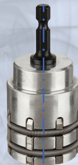
Dedicated capping head